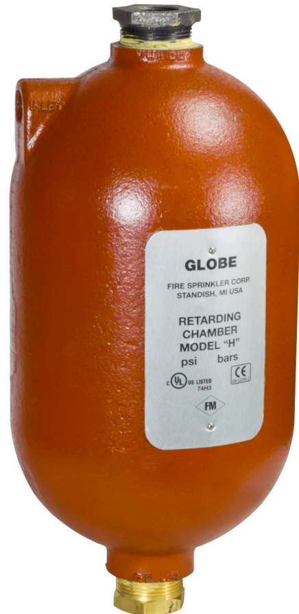
MODEL H RETARDING CHAMBER